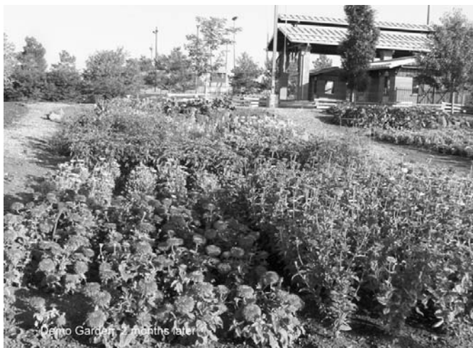
The garden 2 months later ... WOW!