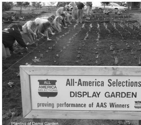
Central Oregon MG's planting demo garden